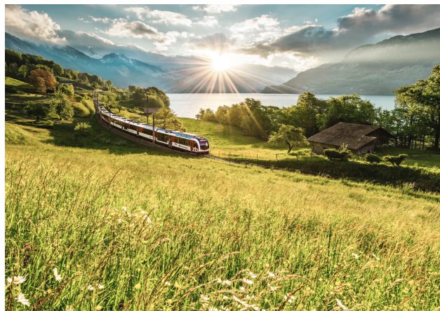
Luzern-Interlaken Express at Lake Brienz, Bernese Oberland, ©Tobias Ryser