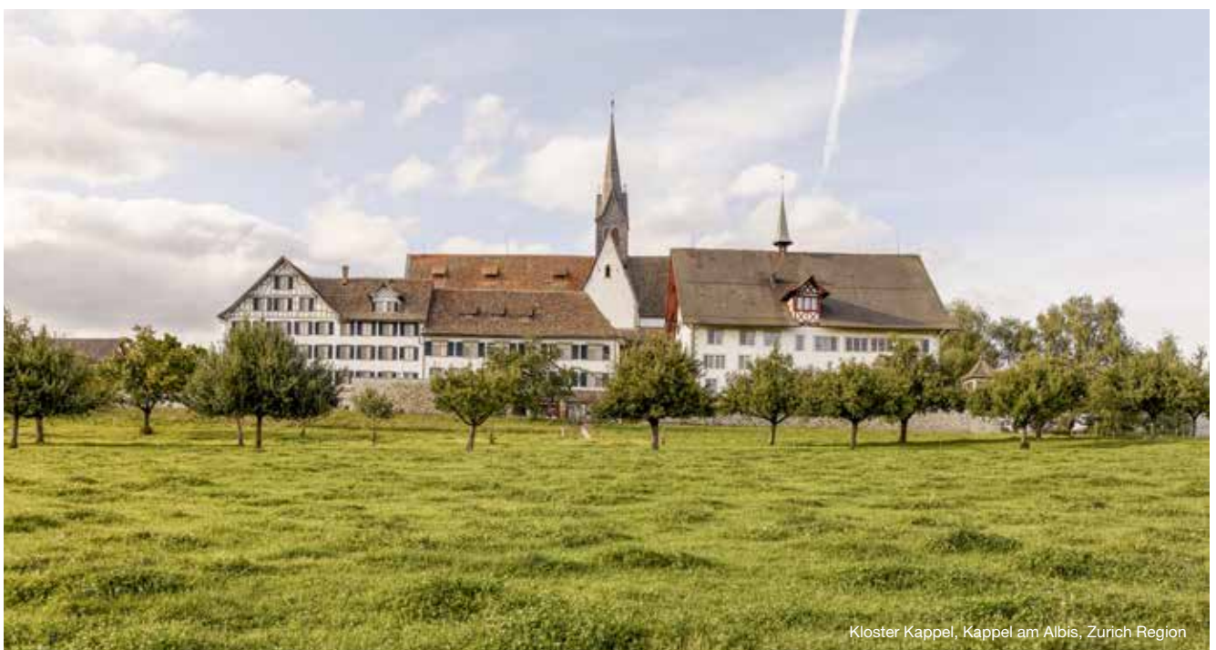
Kloster Kappel, Kappel am Albis, Zurich Region