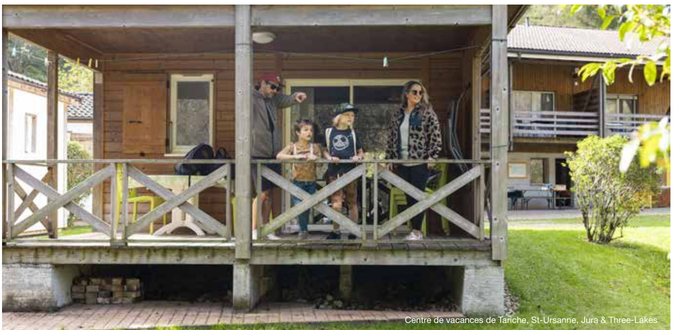
Centre de vacances de Tanche, St-Ursanne, Jura & Three-Lakes