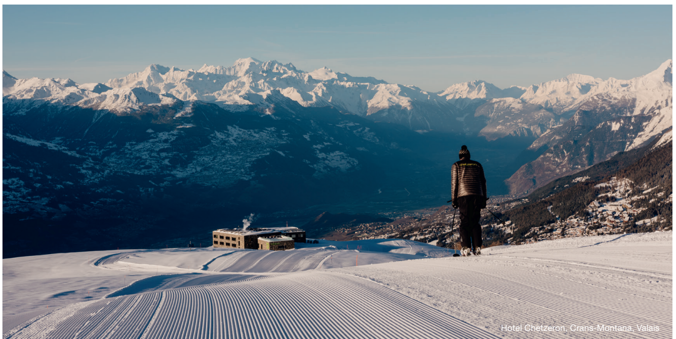
Hotel Chetzeron, Grans-Montana, Valais